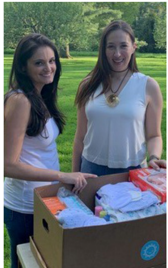
Welcome Baby box

With the support of FJC’s Fiscal Sponsorship Program, Welcome Baby is able to increase distribution, pursue important in-kind donations and sponsorships, and grow awareness of its mission. For more information, please visit www.welcomebabyusa.org