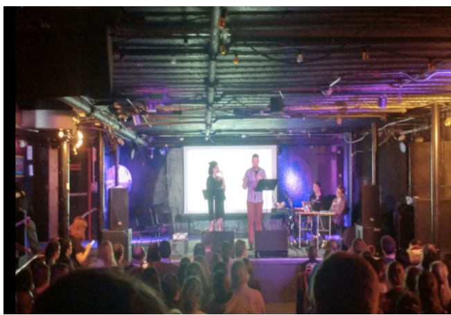
HPST Live! launched in January 2017 at The Middle East in Cambridge, Massachusetts